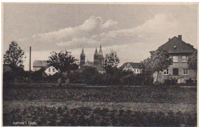
Lohne (Oldenburg), Germany....Ancestral Origin To Our Trenkamp Family Line