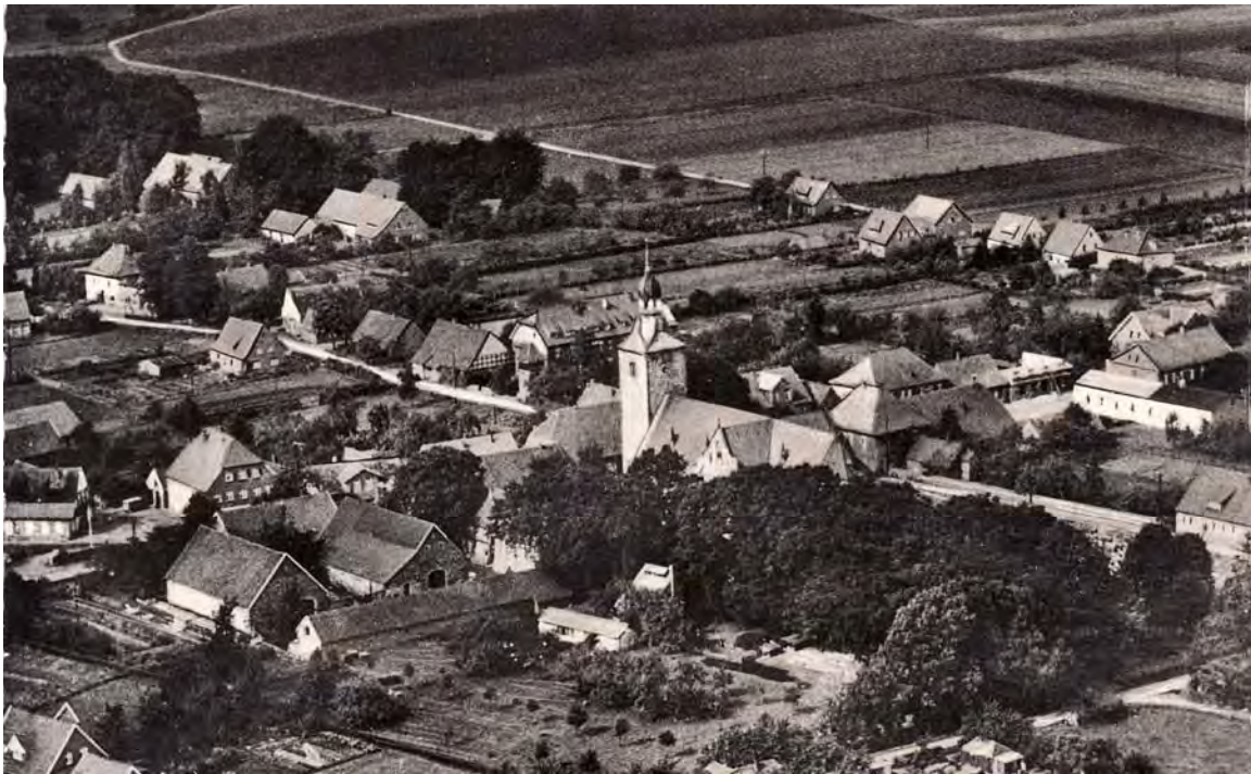
Aerial View of Alfhausen, Germany....Ancestral Origin To Our Düsing Family Line