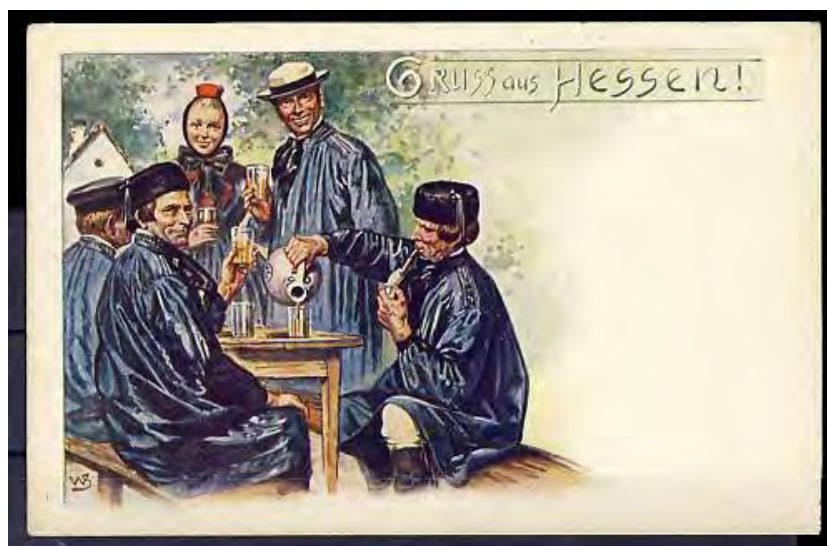
Greetings From Hessen! (Schwalmstadt/Treysa, Hessen, Germany) Ancestral Origin To Our Jungclas Family Line