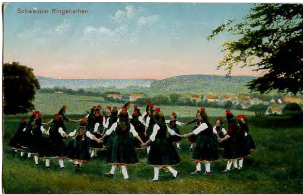
Schwalm Girls Dancing (Schwalmstadt/Treysa, Hessen, Germany) Ancestral Origin To Our Jungclas Family Line