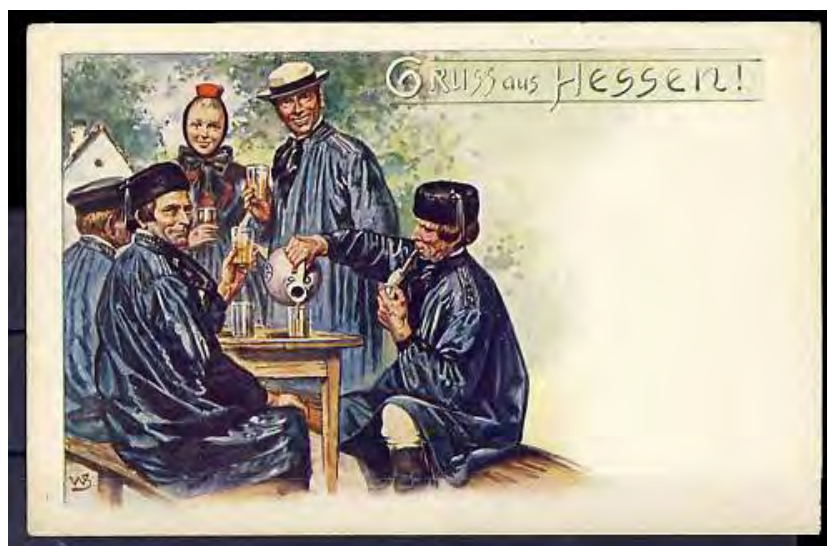
Greetings From Hesse! (Schwalmstadt/Treysa, Hesse, Germany) Ancestral Origin To Our Jungclas Family Line