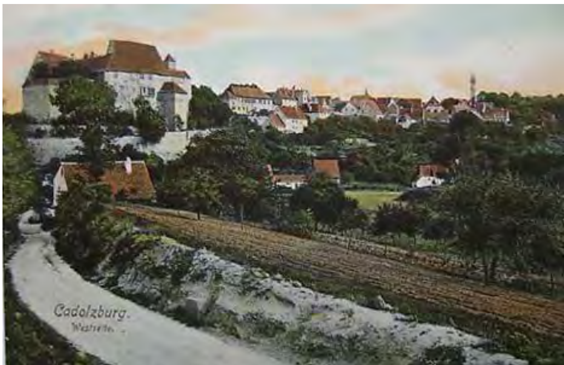
Cadolzburg, Germany....Ancestral Village To Our Feder Family Line