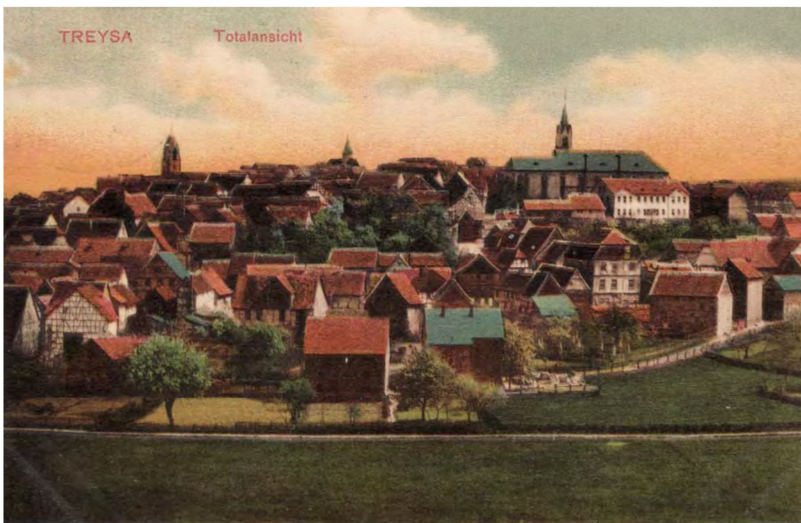
Distant View of Treysa (Schwalmstadt), Germany....Ancestral Origin To Our Jungclas Family Line