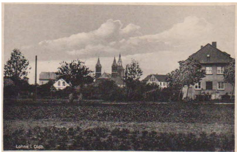
Lohne (Oldenburg), Germany....Ancestral Origin To Our Trenkamp Family Line