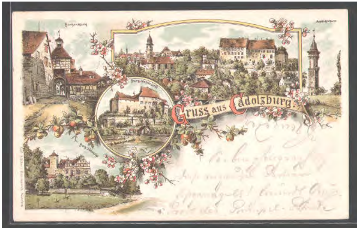
Cadolzburg, Germany....Ancestral Village To Our Feder Family Line