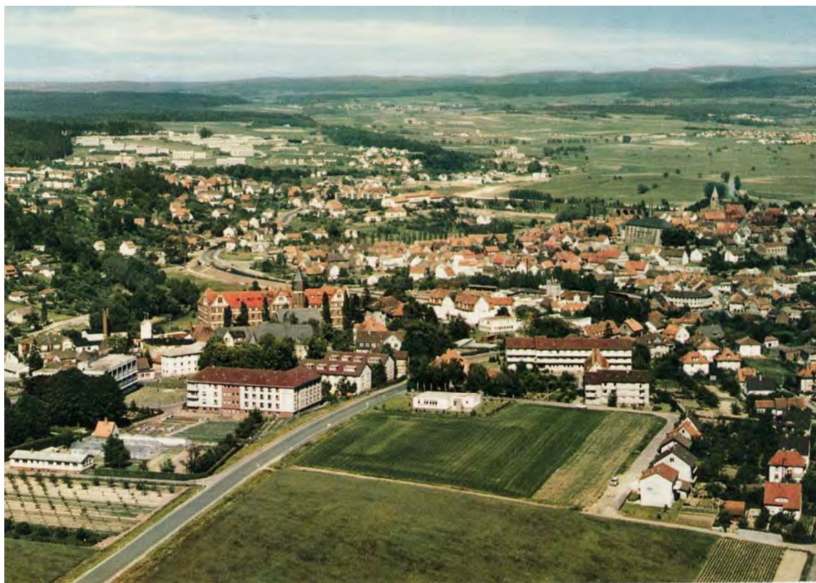
Aerial View of Treysa (Schwalmstadt), Germany....Ancestral Origin To Our Jungclas Family Line