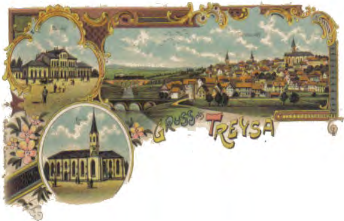
Greetings From Treysa (Schwalmstadt), Germany....Ancestral Origin To Our Jungclas Family Line