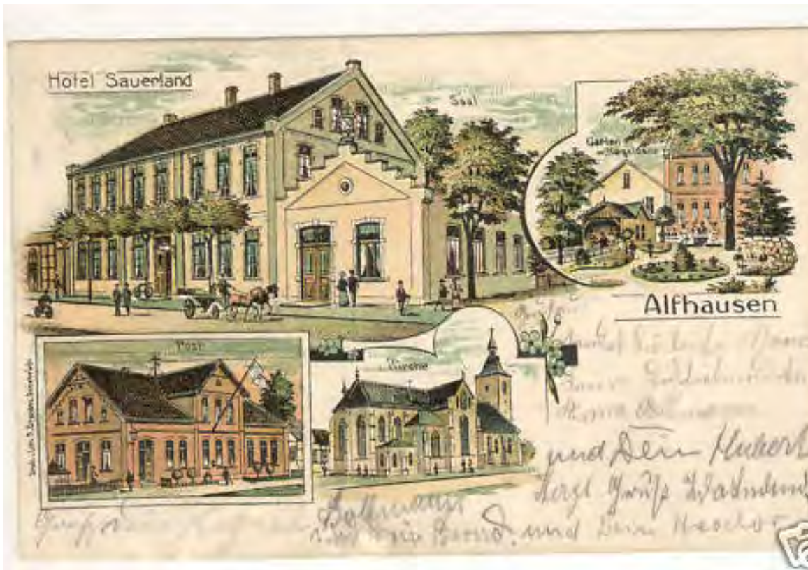
Alfhausen, Germany....Ancestral Origin To Our Düsing Family Line